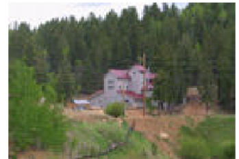
The Lost Dutchman

is going on in Arabian Acres, meet your neighbors, socialize, and express your ideas.