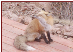
Fox in Arabian Acres